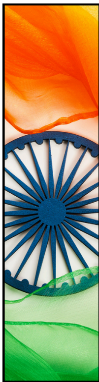
Celebrating Incredible India