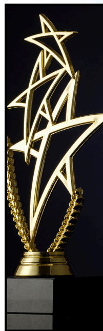
Student of the Month