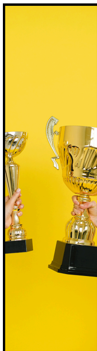
Competitions @ Loyola