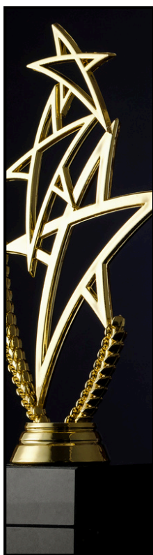
Student of the Month