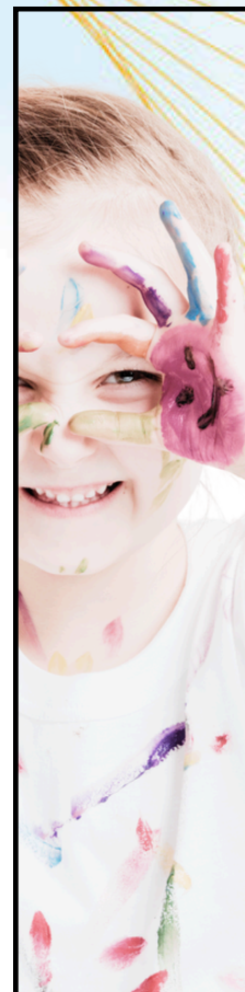
Peek into the Future