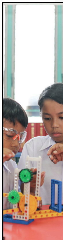
Glimpse of Activities