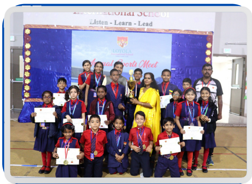
Winners 2023-24 EMERALD HOUSE

Recognizing exceptional accomplishments and admirable sportsmanship, the prestigious house cup was presented to the top-performing house that excelled in a variety of sports competitions held over the year. This magnificent event symbolized the pride of our esteemed institution, highlighting the essence of teamwork and athletic prowess integrated into the essence of our student community.